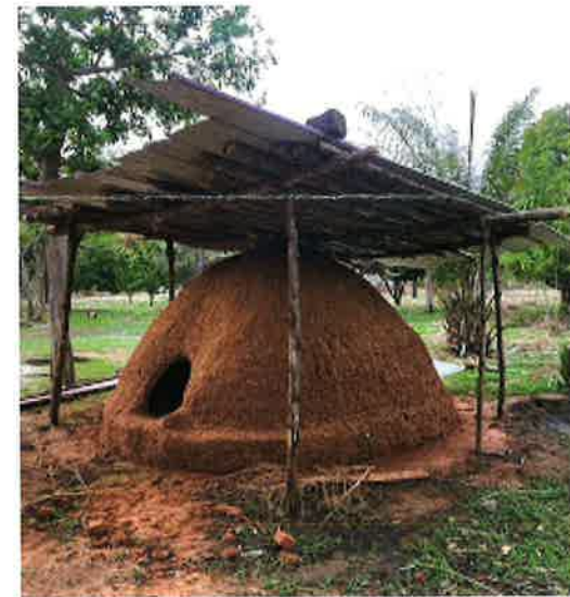
In Ghana, St. Anne’s School turned an ant hill (top) into a clay oven (bottom).